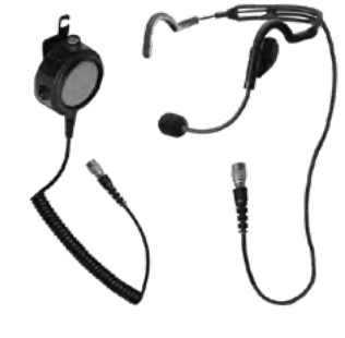
XIPB In-line PTT suits all X10DR audio accessories