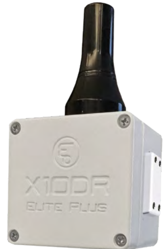
IP65 Weatherproof Temperature rating: -22°F* to +197°F

Because there is no range impact on the length of the connecting shielded cat 6 cable, it means the XRTG Plus can be mounted up to 30 meters plus away from the host radio/control station if need be. This makes the XRTG Plus packaging ideal for warehouse installations, or in those situations where the required building coverage might be better achieved by mounting the gateway in a central building high point overlooking the office work areas below. For Command Post Response vehicles, the XRTG Plus external design makes it also ideal to be mounted on an electric pump up mast, so as to lift the integrated antenna up above any localized obstructions at a disaster scene and thereby ensure greater signal availability for handset users.