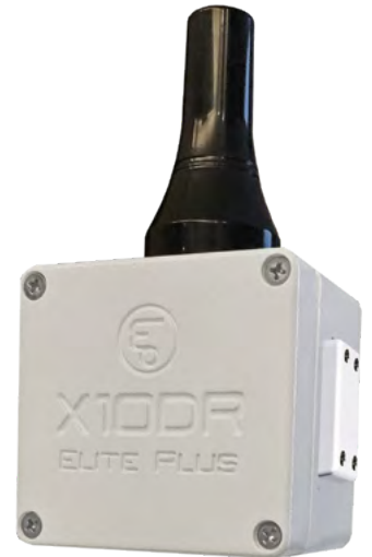
IP65 Weatherproof Temperature rating: -22°F to +197°F

Because there is no range impact on the length of the connecting shielded cat 6 cable, it means the XRTG Plus can be mounted up to 30 meters plus away from the host radio/control station if need be. This makes the XRTG Plus packaging ideal for warehouse installations, or in those situations where the required building coverage might be better achieved by mounting the gateway in a central building high point overlooking the office work areas below. For Command Post Response vehicles, the XRTG Plus external design makes it also ideal to be mounted on an electric pump up mast, so as to lift the integrated antenna up above any localized obstructions at a disaster scene and thereby ensure greater signal availability for handset users.