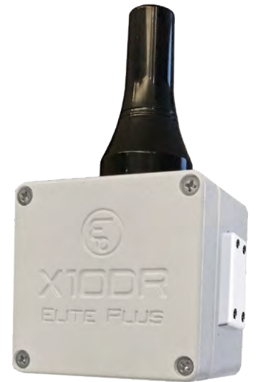
IP65 Weatherproof Temperature rating: -30°C to +92°C

Because there is no range impact on the length of the connecting shielded cat 6 cable, it means the XRTG Plus can be mounted up to 30 meters plus away from the host radio/control station if need be. This makes the XRTG Plus packaging ideal for warehouse installations, or in those situations where the required building coverage might be better achieved by mounting the gateway in a central building high point overlooking the office work areas below. For Command Post Response vehicles, the XRTG Plus external design makes it also ideal to be mounted on an electric pump up mast, so as to lift the integrated antenna up above any localized obstructions at a disaster scene and thereby ensure greater signal availability for handset users.