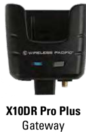
X10DR Pro Plus Gateway