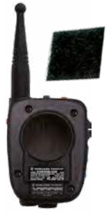
XWMC Velcro® wireless charging mount option includes Velcro patch - for best shoulder placement