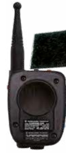
XVMC Velcro® shoulder mount option includes Velcro patch - for best shoulder placement