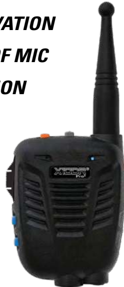
X10DR Pro Plus Handset