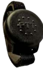
X10DR XWPB Wireless PTT Button