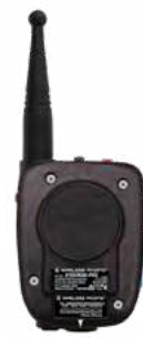
XNMC Non-metal rotary shoulder mount clip - Suit Electrical utilities