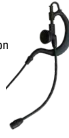
WPULH-X10 Headset Ultra-lightweight earhook style