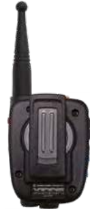
XLMC Standard long rotary shoulder mount clip