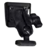
XMDM2 Mobile charger mounting arm