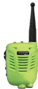
XFCF Custom Front Cover option