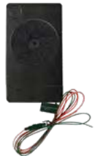
X1WK Mobile wireless charger