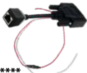
XCA-**** Radio Adaptor Refer price book (typical style)