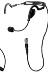
WPHFH-X10 Headset Industrial lightweight