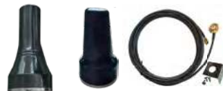
XMPA multipolarity roof/rack mount antenna kit