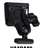
XMDM2 Mobile charger mounting arm