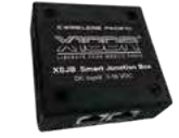
XSJB Dual Radio Interface Box