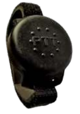
X10DR XWPB Wireless PTT Button