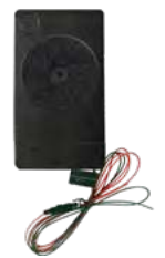
X1WK Mobile wireless charger