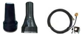
XMPA multipolarity roof/rack mount antenna kit