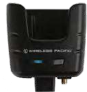
X10DR Elite Plus Gateway