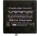
XPB-C14 In-line power bank Interface Box