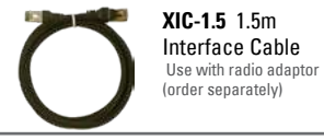
XIC-1.5 1.5m Interface Cable Use with radio adaptor (order separately)