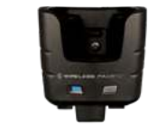
XMVC Mobile charger