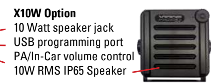
X10W Option 10 Watt speaker jack USB programming port PA/In-Car volume control 10W RMS IP65 Speaker