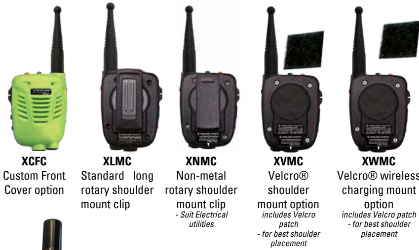
XCFC Custom Front Cover option XLMC Standard long rotary shoulder mount clip XNMC Non-metal rotary shoulder mount clip - Suit Electrical utilities XVMC Velcro® shoulder mount option includes Velcro patch - for best shoulder placement XWMC Velcro® wireless charging mount option includes Velcro patch - for best shoulder placement