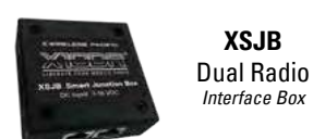
XSJB Dual Radio Interface Box