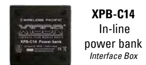
XPB-C14 In-line power bank Interface Box