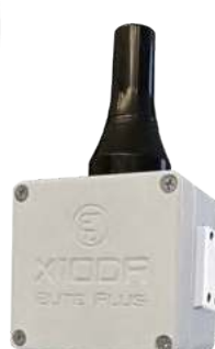
X10DR Elite Plus Rooftop Gateway