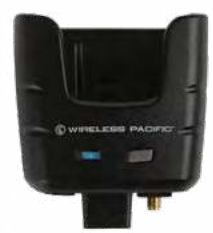
X10DR Elite Plus Standard Gateway