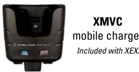
XMVC mobile charger Included with XEX2