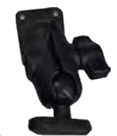
XMDM2 Mobile charger mounting arm