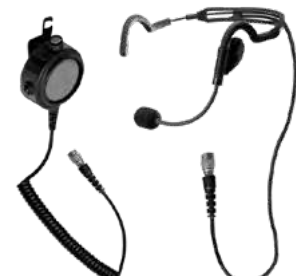
XIPB In-line PTT suits all X10DR audio accessories WPHFH-X10 Headset Industrial lightweight