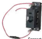
Radio specific XCA adaptor -specify type when purchasing (included in package)

Connects to the rear interface connector on your mobile radio