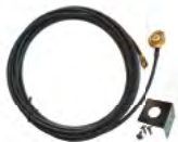
XMPA Antenna cable kit (included* in package)

XMPA Multi polarity antenna includes 5.2 meters of low loss LMR200 type coax and terminated with an RP SMA male connector. Provides optimum coverage especially in non-line of sight situations Mount on a vehicle roof or a roof rack using the supplied L Bracket - clear of obstructions in the direction you wish to predominately communicate.