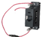
Radio specific XCA adaptor -specify type when purchasing

Connects to the rear interface connector on your mobile radio