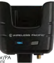
Pro model Products not shown to size - for illustrative purposes only

Note: Product contains Neodymium, rare earth magnets, Keep away from credit cards or like items, that can be damaged by strong magnetic fields.